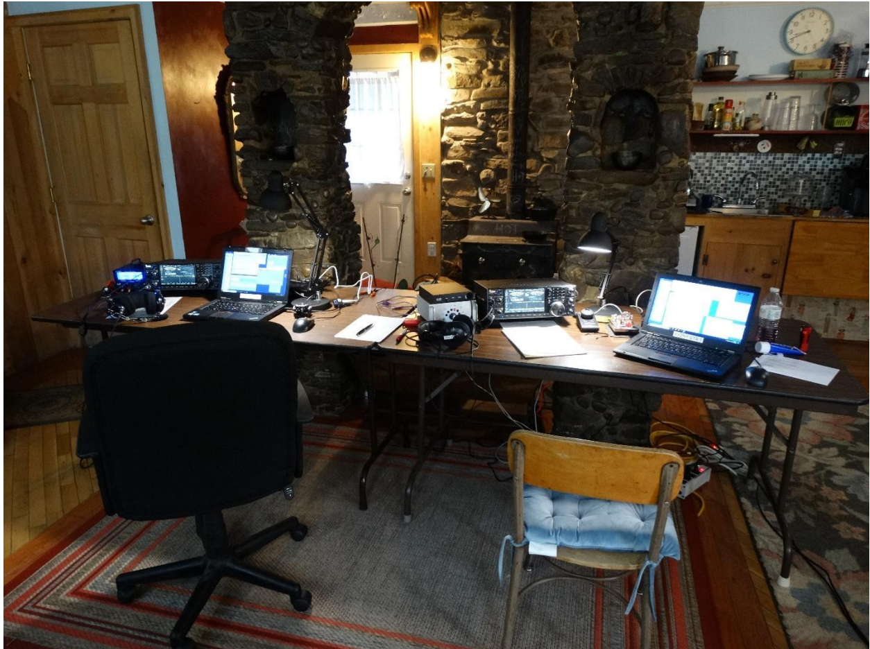
The KX2NY Field Day style multi-multi operation. W2XL and K4HA racked up over 1000 QSOs and came away with the New York Most Counties Worked plaque.