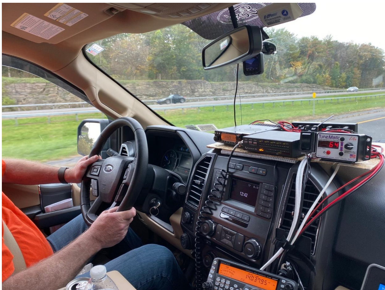
Inside the cockpit of N2MG/M. Mike's excellent mobile station consists of a Kenwood TS-480HX and two Tarheel 100A-HP screwdriver antennas.