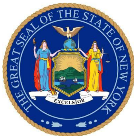
Seal of the State of New York